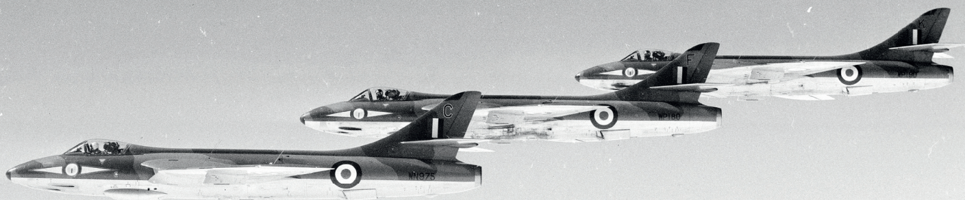
Hunter Mk 5s replaced the Meteors. This formation was flying from Tangmere on April 26, 1956.

against challenging targets, and integrating with USAF stealth platforms. This involved the co-ordination of more than 80 combat aircraft, by day and night and in all weathers, fighting against very realistic surface and air threats, and provided us with exceptional training. The Squadron put in a superb performance and I am extremely proud of what everyone achieved."